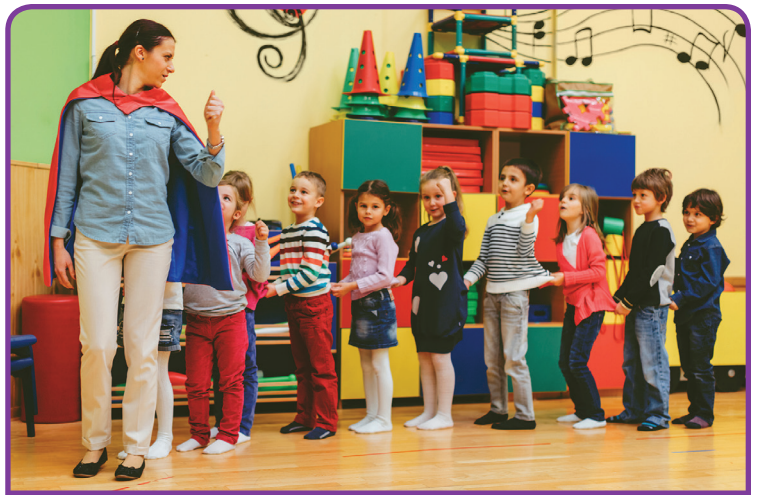
Celebrating 35 Years of Focus!

Registration begins January 2, 2019. Questions? 360.752.8447